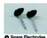
⑤ Spare Electrodes